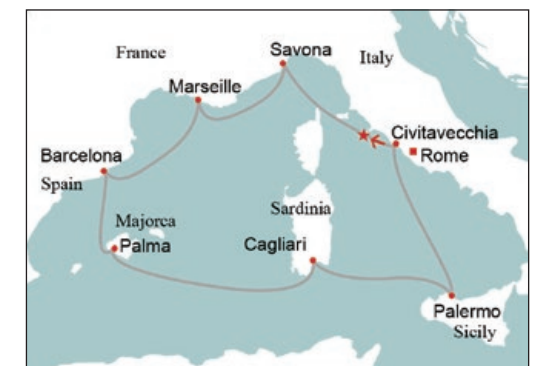
The Costa Concordia sailed a seven day circular route.

Costa Concordia belonged to a new generation of cruise ships designed to transport thousands of passengers at a time. It was powered by six diesel-driven turbines, each the size of a school bus. Together they produced an incredible 100,000 horsepower.