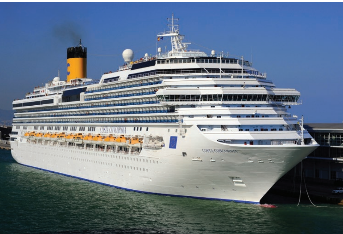
The Costa Concordia , one of the largest cruise ships in the world.

When more than 4,000 passengers and crew members boarded the Costa Concordia on January 13, 2012, it is doubtful that any of them had the Titanic in mind—even though news of the upcoming centennial of the Titanic disaster was receiving widespread media attention. No one could believe that the lesson of the Titanic applied to them. They would be traveling the Mediterranean where icebergs are non-existent, and since modern ships are categorically safer than the Titanic , there was certainly no need for concern.