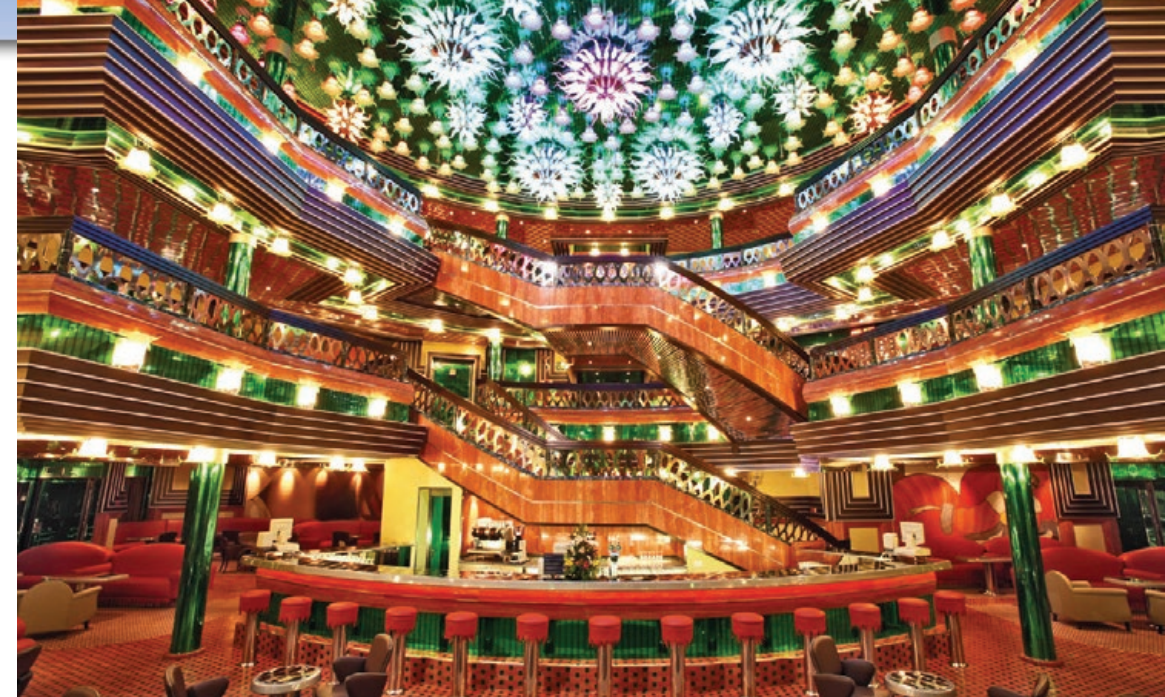
One of Costa Concordia 's halls.

In a dialogue between Costa Concordia 's Captain Francesco Schettino and a Czech reporter aboard his ship, Schettino said, "I wouldn't want to be the captain of the Titanic , forced to navigate between icebergs. But I think that with the right preparation any situation can be overcome and any problem prevented."